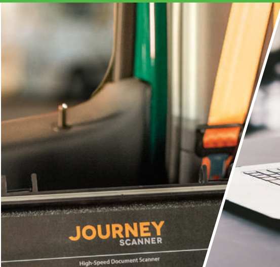
Driver scans Delivery Receipt at the time of delivery.