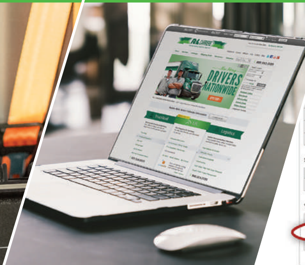
Login to MyRLC at rlc.com, enter the PRO # in Shipment Tracing.